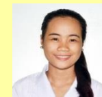
New in the Philippines, 2019