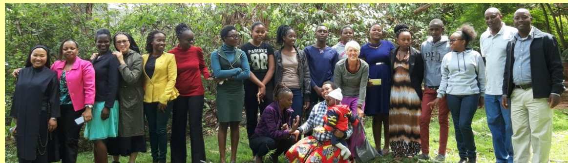
The participants of the students day in Nairobi 2018